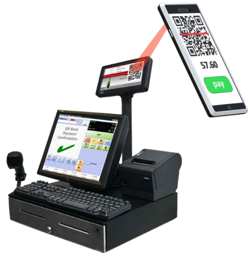
Scan QR bill and pay